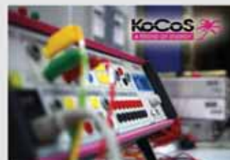
Automatic Relay Test System (Kocos, Germany)