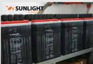
Batteries that are robust energy storage solutions, with a proven technology that has been used for decades.