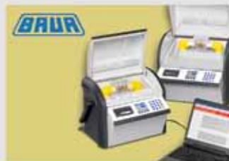
Fully Automatic Measurement of the dielectric strength of liquid insulators up to 100 kV. (BAUR, Austria)