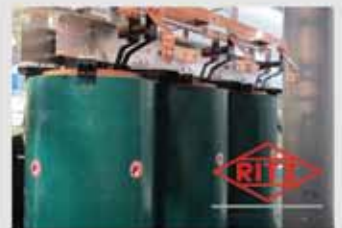
Dry-type Cast Resin Glass Fibre reinforced vacuum technology (WTE) Power Transformers (WTW, Germany)