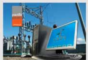
A solution package for system integration, substation automation and energy management system. (PPI Pazifik Power, Inc., Philippines)