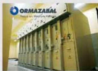
Hermetically sealed and SF6 insulated compact switchgear up to 36kV (Ormazabal, Spain)