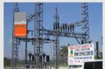
Turnkey Substation up to 100MVA (PPI Pazifik Power Inc., Philippines)