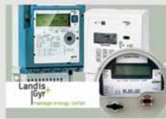
High efficiency and precision Electricity Meters (Landis+Gyr, Switzerland)