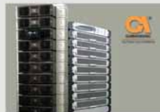
Modular UPS solutions in multiple capacity options (Gamatronics, Israel)