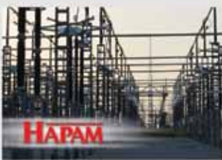
Disconnecting Switches 15kV up to 800kV (Hapam, Netherlands)

PPI's seasoned Electrical Engineers deliver the unique support tailored fit for each customer's needs. PPI's cutting edge is its high product quality with an unparalleled delivery of after- service performance.