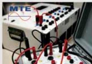
State of the art Meter Testing and Calibration Equipment and Instrument Test Set (MTE, Switzerland)