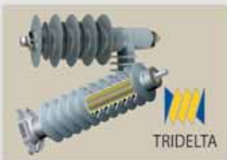
Silicon Arrester in Cage Design and Distribution Type Arrester (Tridelta, Germany)